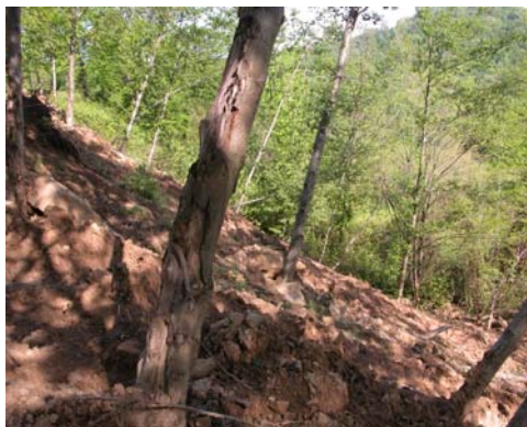
Fig. 4. Landslide in Galandrud coals mine.

The landslide that occurred in the sediments of Shemshak formation in the central Alborz is more rotational. In this type of landslide, the surface of slide is curative and often his spoon shape that happen often because of water of interamolecules and under influence of hard raining (fig.4). Topography is the controller factor in extension and intensity of earth slide in central Alborz especially in Galandrud area because the deepest part of mine is in the place higher than surrounded lands.