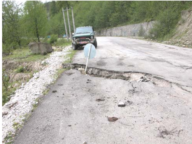
Fig. 3. The cracks have been created in Galandrud road.

2- Increasing of water pressure intermolecules in substance that are on slope especially through probably slide surface: this is the most important factor for landslide under influence of exploitation from coal mines in the central Alborz and shows near relation between landslide with low deep with the flow of destroying substances of Shemshak formation in the fluid from and hard raining of height of the central Alborz.