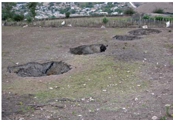
Fig.2. The created holes in Glalndrud coalfield.

In the central Alborz zone, a type of sedimentary layers that cove the coal beds cause that roof-strata of coal beds often consists of shell, siltstone or sandstone, in fact , more than 50% of the volume of covering stone of this coal beds consist of shel. It causes at the time of usage of coal from the tunnels of mines that there are an extended empty space under the weak argillite layers, these layers that are not so powerful for tolerating the upper layers, especially in deep earth, since there is no column or support for transferring of upper forces, break downward under the influence of the upper layers' forces and by creating wide and extended holes and cracks on the upper layers, as seen on figure 2, extended subsidences are created [8].